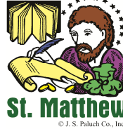
St. Matthew

Kansas New Vision Korean Church, and Valley View United Methodist Church will come together for a music festival. Admission is FREE! Reception to follow in the church hall. All are welcome!