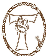
Franciscan Servants of the Holy Family