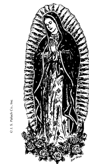
Nuestra Señora de Guadalupe